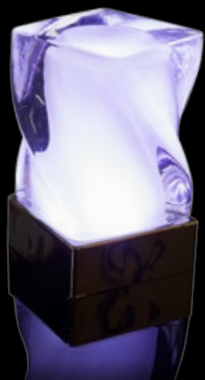
swirl size: 7.5 x 7.5 x 13cm material: glass