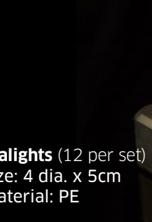
tealights (12 per set) size: 4 dia. x 5cm material: PE