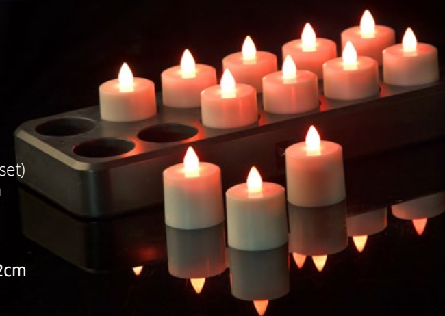
tealights charger tray size: 30 x 12cm