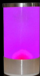
sassy size: 7.5 dia. x 13cm material: acrylic