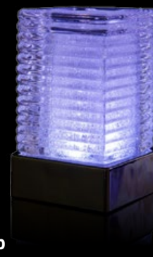
rib size: 7.5 x 7.5 x 13cm material: glass