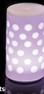
dots size: 8.5 dia. x 16.5cm material: glass