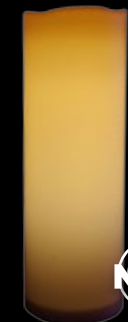
flameless candle (4 per set) size: 8 dia., height various material: PE