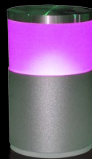
siren size: 7.5 dia. x 12.5cm material: acrylic