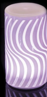
twist size: 8.5 dia. x 16.5cm material: glass