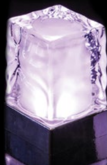
ice size: 7.5 x 7.5 x 12.5cm material: glass