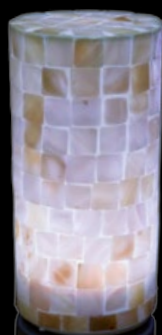
mosaic size: 8 dia. x 16cm material: glass