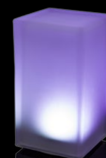
block size: 8 x 8 x 13cm material: glass