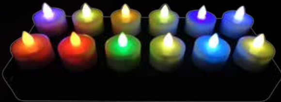
tealights (12 per set)